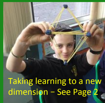
Taking learning to a new dimension – See Page 2

WORKING TOGETHER TO BE THE BEST WE CAN BE