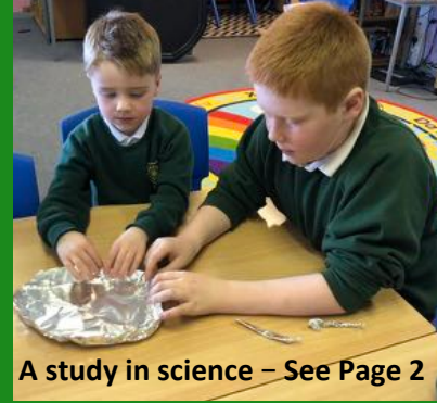
A study in science – See Page 2

WORKING TOGETHER TO BE THE BEST WE CAN BE