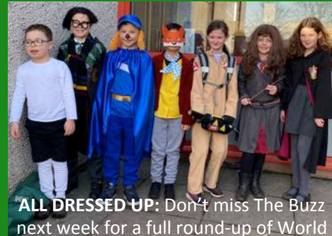
ALL DRESSED UP: Don't miss The Buzz next week for a full round-up of World Book Day activity from Milltimber

WORKING TOGETHER TO BE THE BEST WE CAN BE